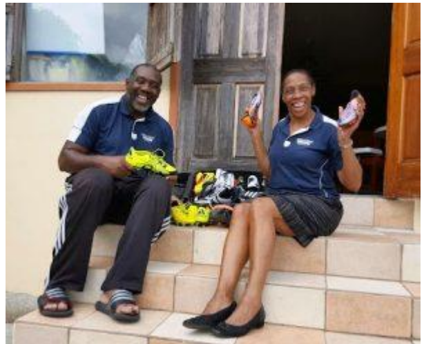
SSF & colourful new kit

Today I travelled to watch the C.A.R.E football team take on another school in a Seniors knock out league. They were smartly turned out in their grey football kit - which is on loan to them from the Sacred Sports Foundation.