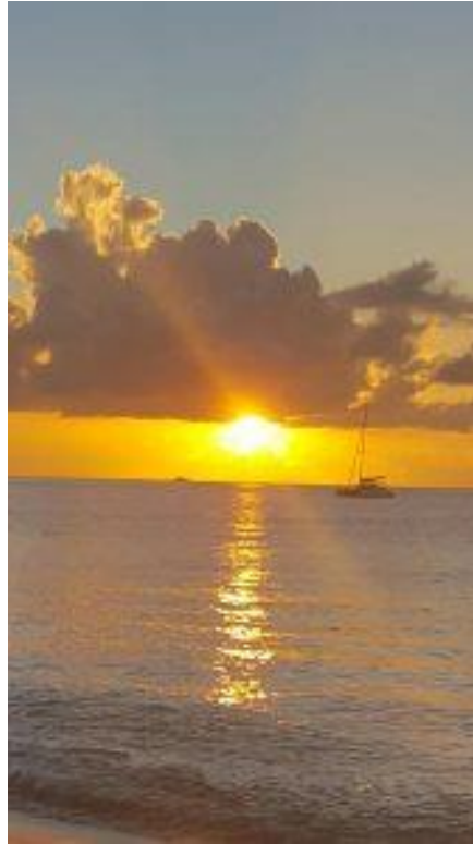
sunset at Rodney Bay