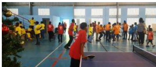
Festival of fun

Today SSF hosted the Digital Sponsored Festival of Fun. The event was attended by government officials and this year was the 5th anniversary. Around 400 children with disabilities were invited to attend. Each wearing a T Shirt representing the colour of their special needs school. After a few important speeches and singing of the national anthem (I know most of the words now!) the fun began!