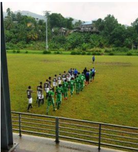
boots for some

What shocked me though was the lack of football boots and shin pads. The kids were literally swapping their kit with the ones on the bench and swapping over again when a sub was made because they just didn't have enough between them for 11 players.