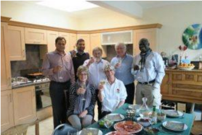
international friends & colleagues