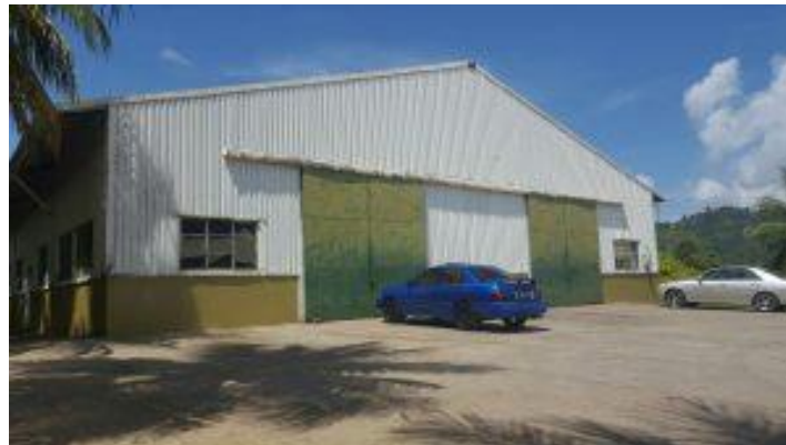
Odsan C.A.R.E. facility